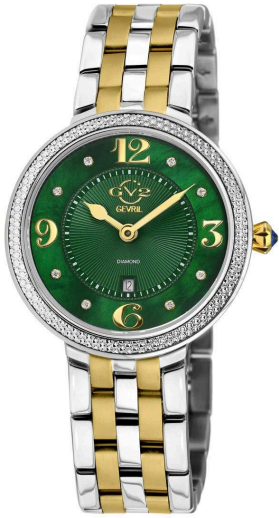
GV2 Verona Diamond (Price)