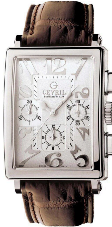
Gevril Avenue of Americas (Price)